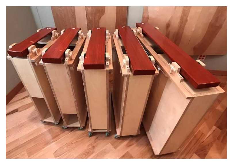
Drum Circle "Deluxe" 8-Notes [Left to Right:] C3, A2, G2, D2, C2, A1, G1, D1 <sup>1</sup> $6001 <sup>2</sup>